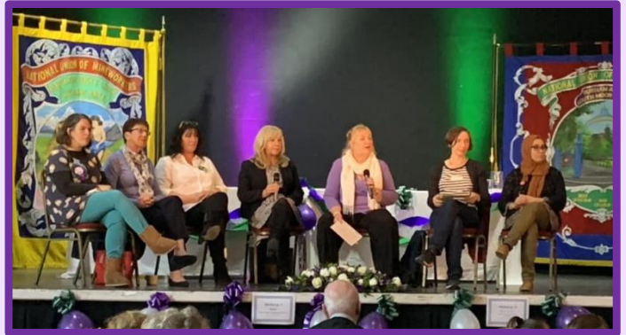
Question Time Panel

Praise on the day from many of those attending the event was reflected in evaluation forms which reveal a high level of satisfaction and enthusiasm for taking issues raised, forward.