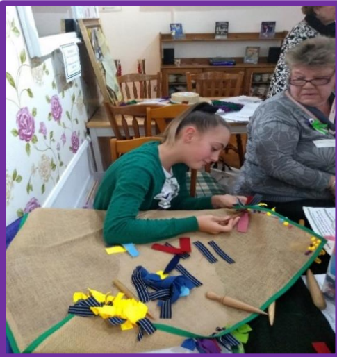
Ava makes her first proggy mat with Just for Women.