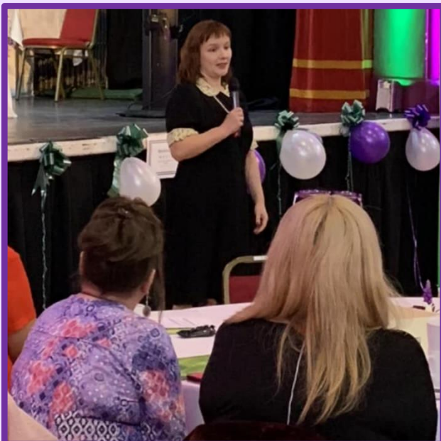
Time bandits recreate the experiences of women from our past