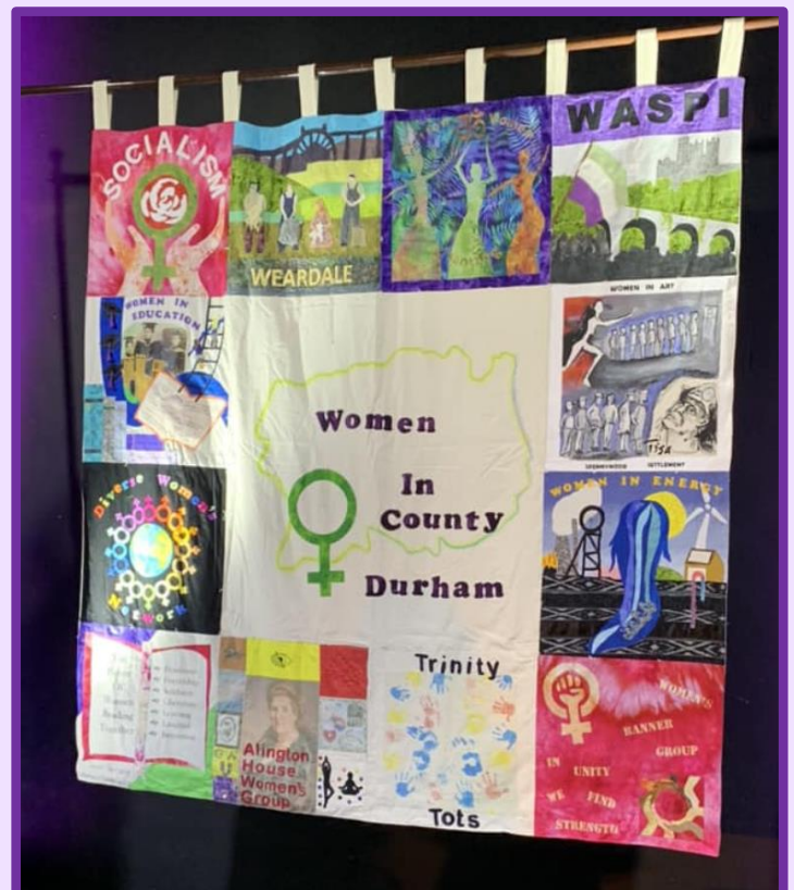
The brilliant Women's Banner group told us of their successful, cooperative project.