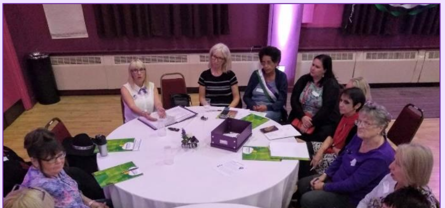
WASPI Women discuss injustice, get advice and make campaign plans