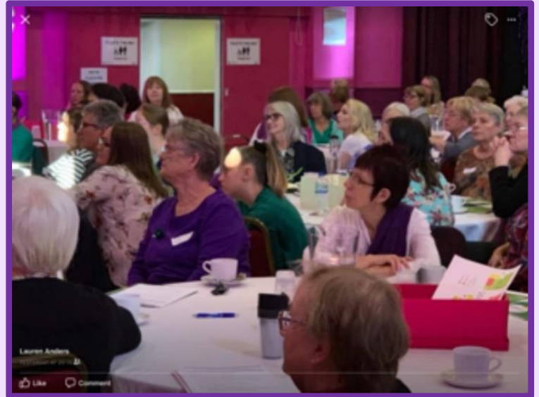
Participants, engaged by the exceptional speakers